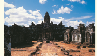
Bakong . Dedicated to Lord Shiv called " Shri Indreshwar ", it was built by King Indravarman I in AD 881. It is the first major temple using extensively sandstone. (G2, 16 kms)