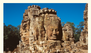
Bayon . Dedicated to Lord Shiv and Lord Buddh , and built by King Jayavarman VII in the end of the 12th century. It has 54 face towers and bas relief galleries. (D5, 10 kms)