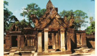
Banteay Srei . Dedicated to " Shri Trbhuvanmaheshwar " (Lord Shiv ) and built by the spiritual teacher of King Jayavarman V in AD 967. (35 kms)