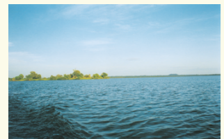
West Mebon in Western Baray. (B5, 12 kms)