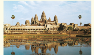
Angkor Wat . Dedicated to Lord Vishnu , and built by King Suryavarman II in the first half of the 12th century. It is the largest temple in the world. (D4, 7 kms)